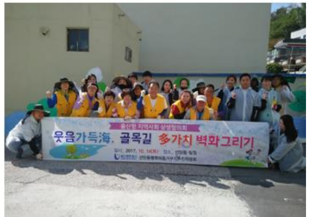
Wall painting for Sea of Laughter (Oct. 14, 2017)