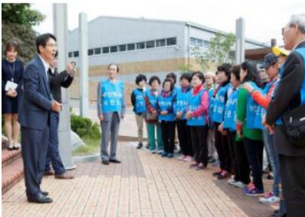
Visit to public gathering at Busan Port (Oct. 12, 2015)