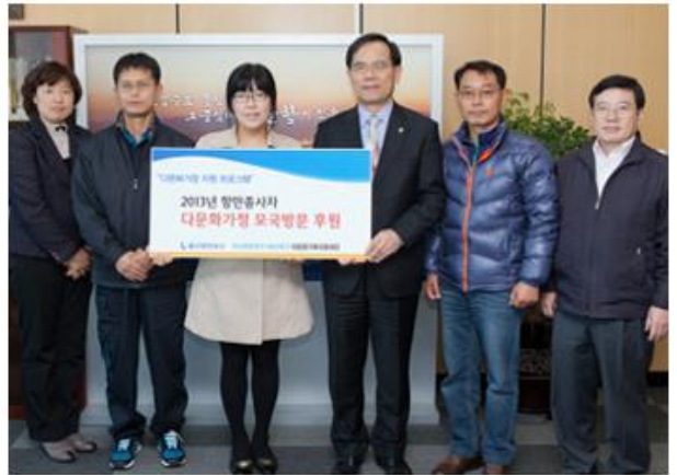
Support visits to home countries of foreign workers at the port in multi-cultural families (Nov. 22, 2013)