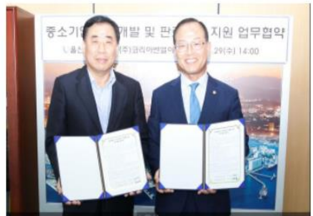
Business agreement on SME resources (July 29, 2015)