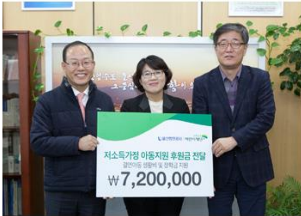
Donation to children of low-income families (Nov. 25, 2016)