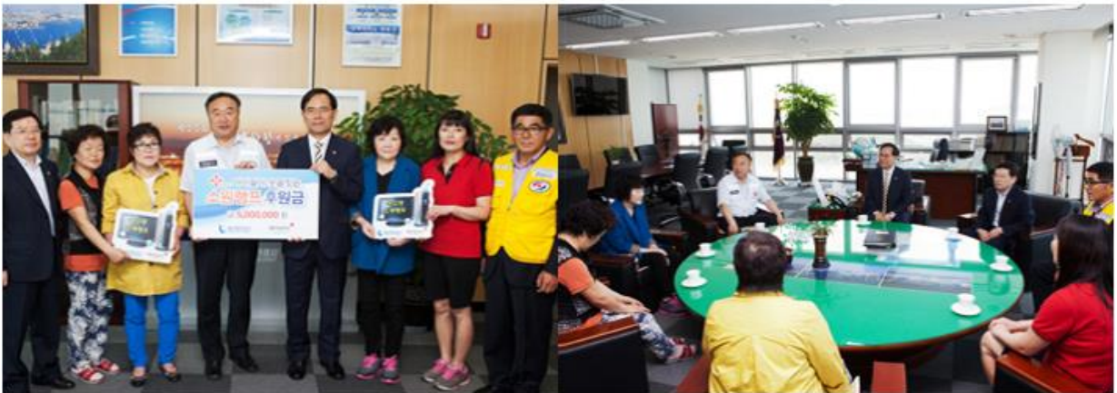
Support youth from vulnerable families with computers (May 27, 2014)