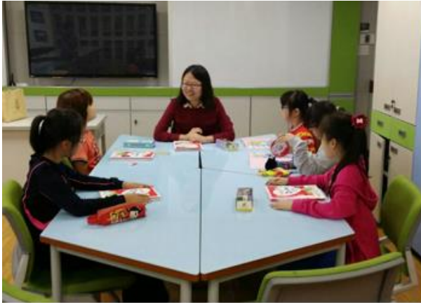
After-school activities at Jangsaengpo Elementary School (year-long)