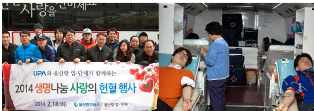
Blood donation jointly by relevant institutions and organizations (Feb. 18, 2014)