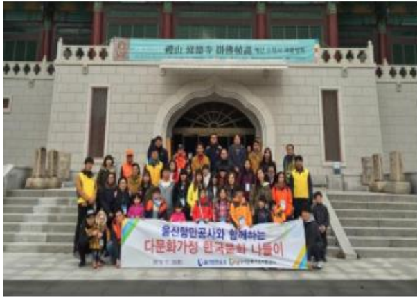
Ulsan outing of multi-cultural families in Nam-gu (Nov. 28, 2015)