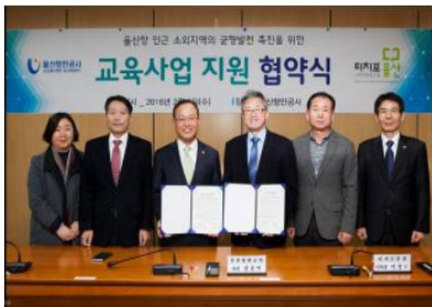
Agreement ceremony for support of educational projects [Teach for Ulsan] (Feb. 3, 2016)