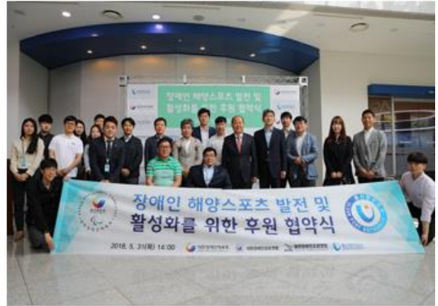
Participate in joint programs with companies under social contribution in Ulsan (Sep. 19, 2018)