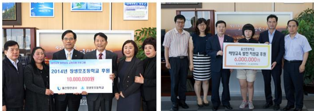
Support maritime training for youth at Jangsaengpo Elementary School (Apr 22, 2014)