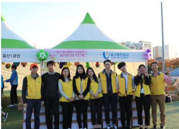
Volunteer activity by corporate alliance (Oct. 30, 2017)