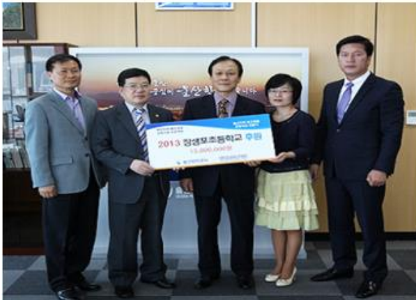
Provide support to 1-company, 1-school program at Jangsaengpo Elementary School (Apr 40, 2013)