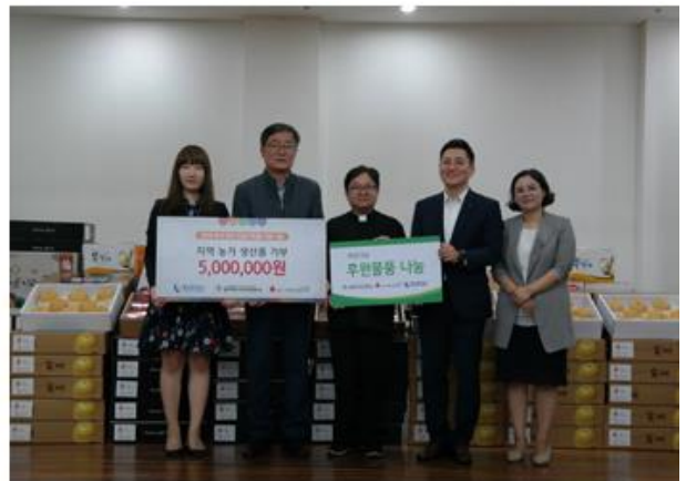
Sharing of young radish mulkimchi with veteran families (June 23, 2018)