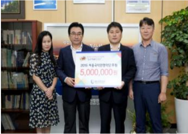
Sponsor Cheoyong Korean music orchestra (Aug. 12, 2015)