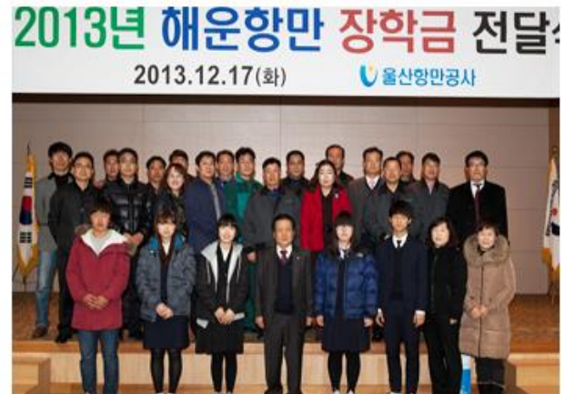
Deliver shipping and port scholarship for 2013 (Dec. 17, 2013)