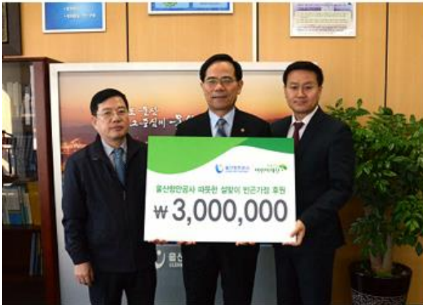
Support low-income families and families led by grandparents for New Year's day (Jan. 16, 2014)