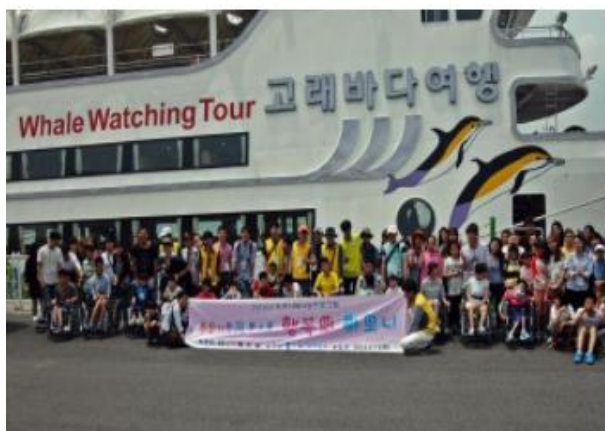
'Happiness Harmony', spring outing for Sea of Laughter (June 11, 2016)