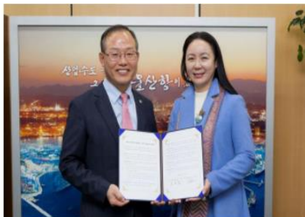
Agreement ceremony for revitalizing Ulsan Port traditional performance (Mar. 4, 2016)