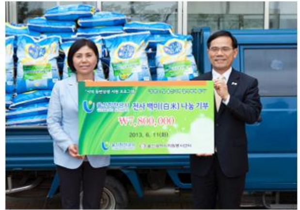
Support rice-sharing with underserved groups in Jangsaengpo (June 11, 2013)