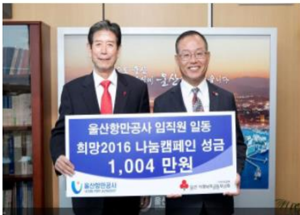
Hope 2016 Nanum Campaign (Dec. 28, 2015)