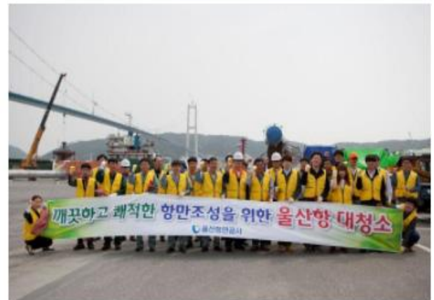
Cleaning of Ulsan Main Port (May 15, 2015)