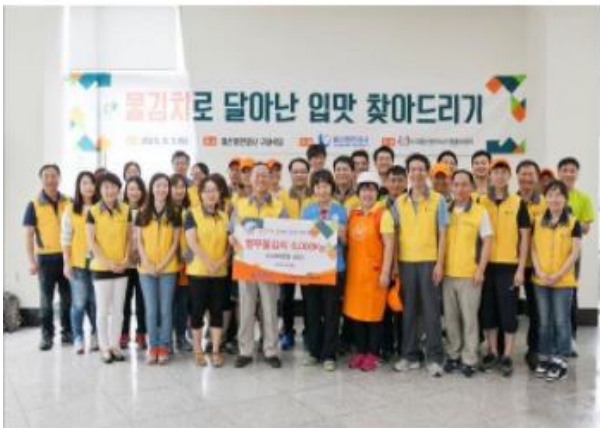
Volunteer activity to make mulkimchi (Sep. 5, 2015)