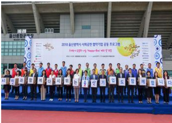
Sponsorship agreement to revitalize maritime sports for disabled people (May 31, 2018)