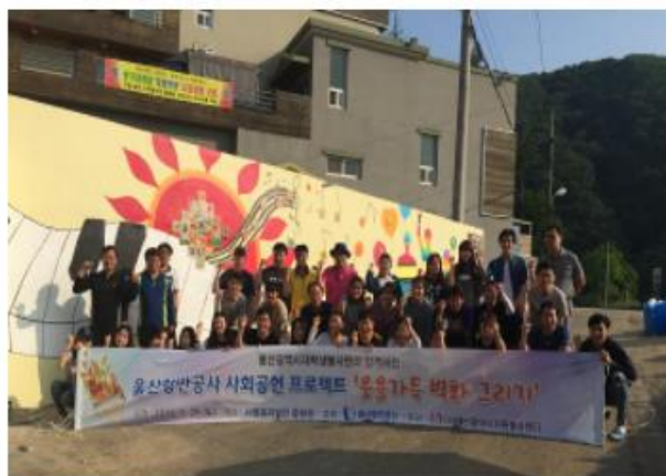
Wall-painting for laughter (May 28, 2016)