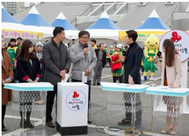
Delivery of year-end donation (Dec. 13, 2016)