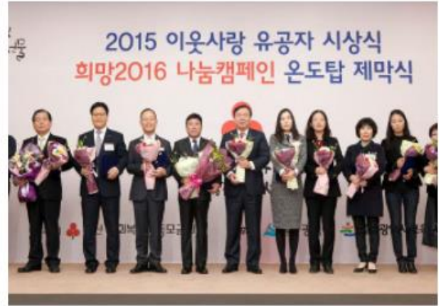
2015 award ceremony for Love Neighbor Program (Dec. 1, 2015)