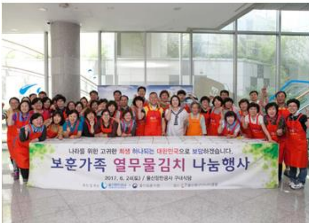
Sharing of young radish mulkimchi with veteran families (June 24, 2017)