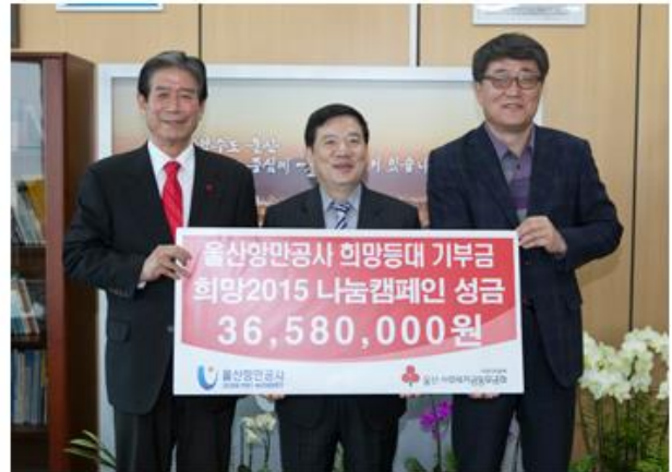
Contribute to matching grant of staff for treatment of intractable diseases (Dec. 24, 2014)