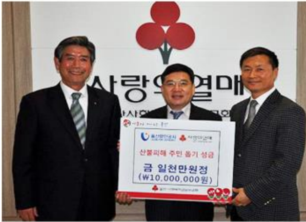
Donation for refugees from mountain fire in Ulju-gun (Mar. 18, 2013)