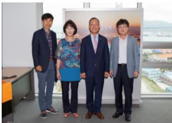
Social contribution review board (June 10, 2016)