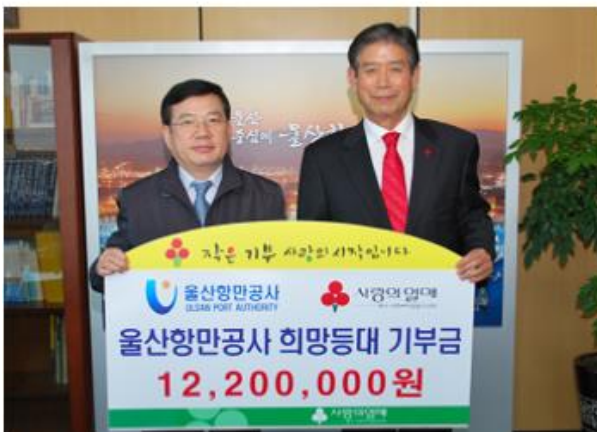
Deliver UPA Hope Lighthouse donation (support medical treatment including cancer)