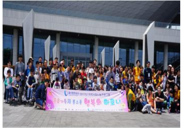
Spring outing for Sea of Laughter (May 20, 2017)