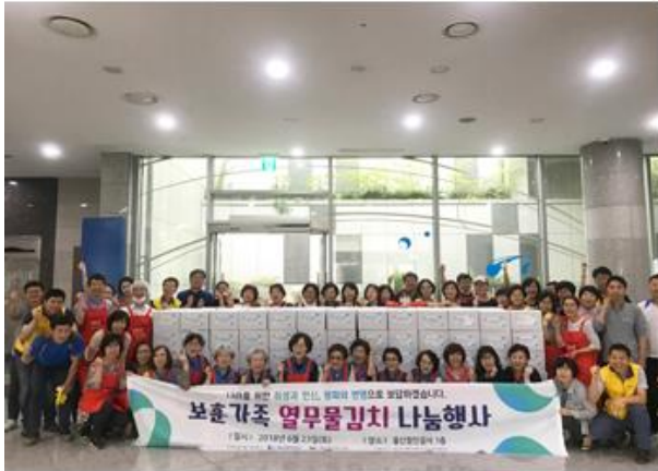
Sponsor welfare complex for the disabled for Korean Thanksgiving (Sep. 18, 2018)