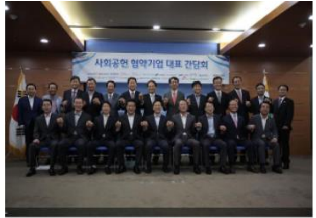
Seminar for representatives of companies under the social contribution agreement (Sep. 2, 2015)