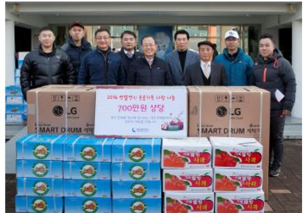
Delivery of care package to the army (Dec. 1, 2016)