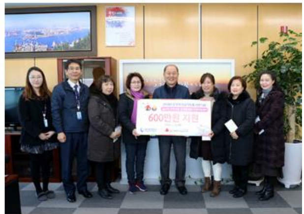
Sponsor Santa Expedition Campaign by Child Fund Korea (Dec. 12, 2018)