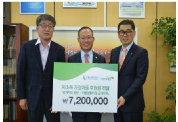
Donation to youth of low-income families (Nov. 17, 2015)