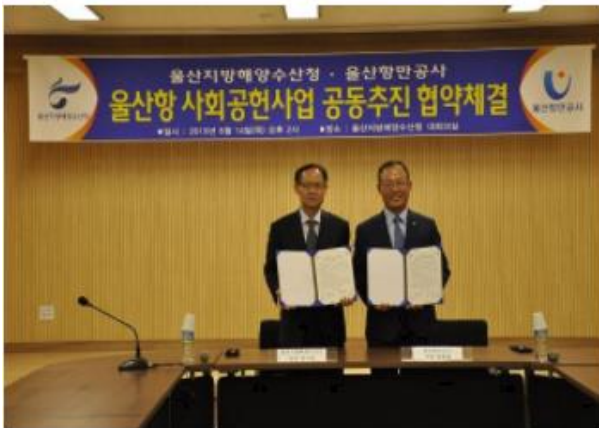
Joint agreement to pursue social contribution project at Ulsan Port (May 14, 2015)