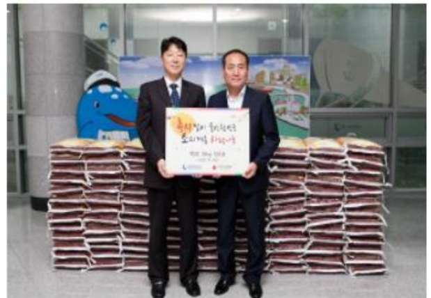
Donation to underserved families near Ulsan Port for Korean Thanksgiving (Sep. 17, 2015)