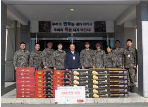
New-year consolation to military troops (Jan. 26, 2017)