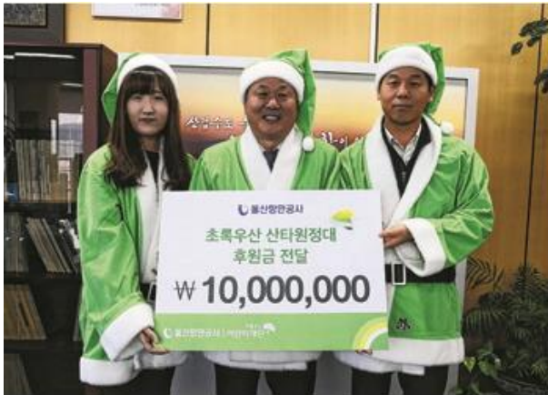
Donation to regional youth center for New Year (Feb. 13, 2018)