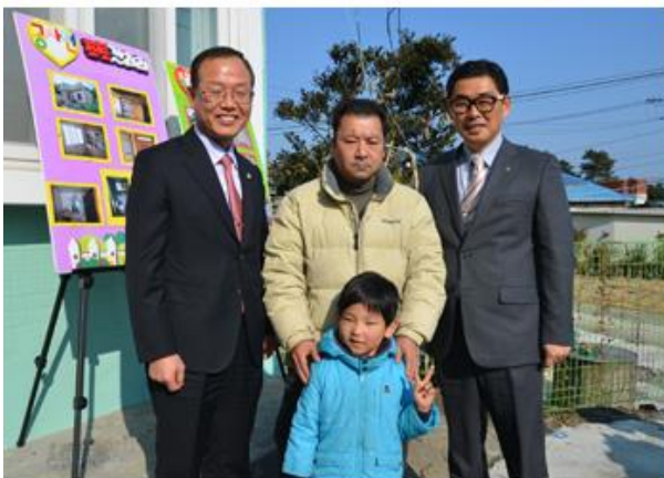
Remodeling of Hope House no. 8 (Oct. 18, 2014)