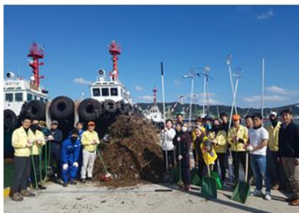
Collection of waste from Typhoon Chaba (Oct. 9, 2016)