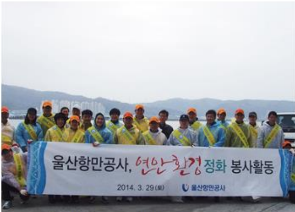
Volunteer activities to clean up coastal environment (collection of waste at downstream of Taehwa River, etc.) (Mar. 29, 2014)