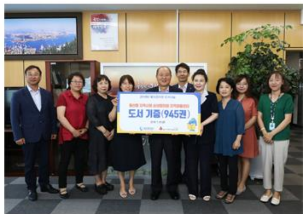
Restore local agricultural families participating in direct marketplace of local produce (Sep. 17, 2018)