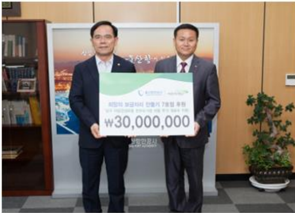
Support housing for single-parent families (July 25, 2013)