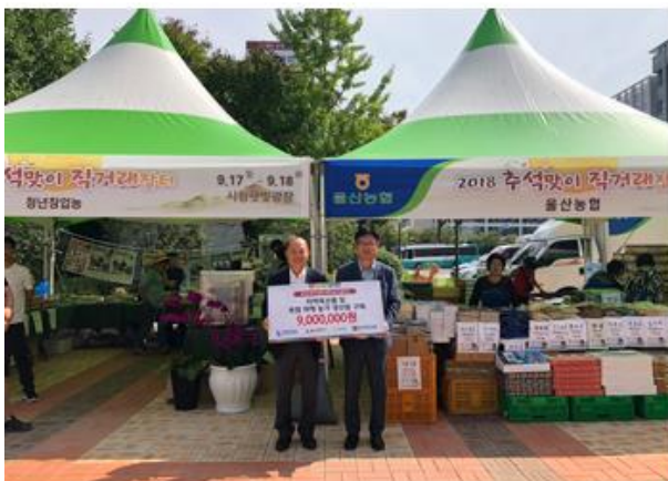
Book donation to local youth center of the joint growth council at Ulsan Port (July 20, 2018)