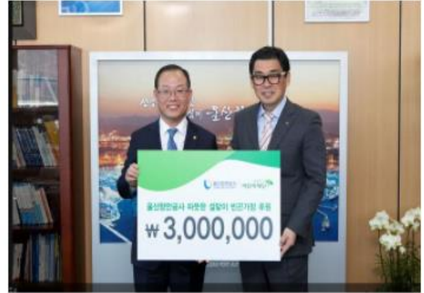
Deliver donation to underserved neighbors for New Year's day (Feb. 13, 2015)