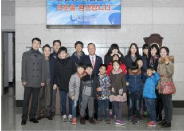
Visit staff of Daegu Catholic University and children at the newborn center (Jan. 28, 2015)