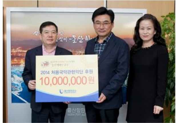
Mecenat to Cheoyong Korean music orchestra (Nov. 26, 2014)