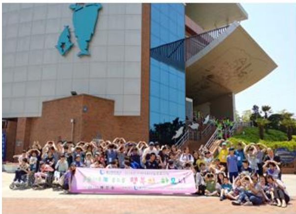
Organize maritime sport activities for the disabled youth in Ulsan Maritime Youth Club (Oct. 20, 2018)