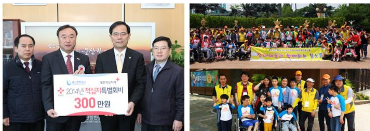
Support special membership fees to Korean Red Cross in 2014 (Jan. 14, 2014)