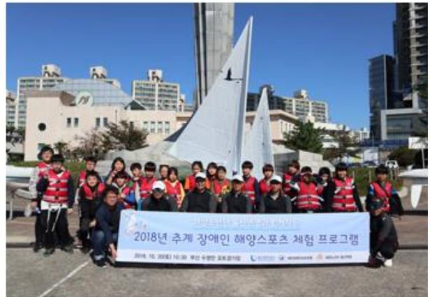
'Happiness Harmony', spring outing of for Sea of Laughter with Hyejinwon (May 26, 2018)