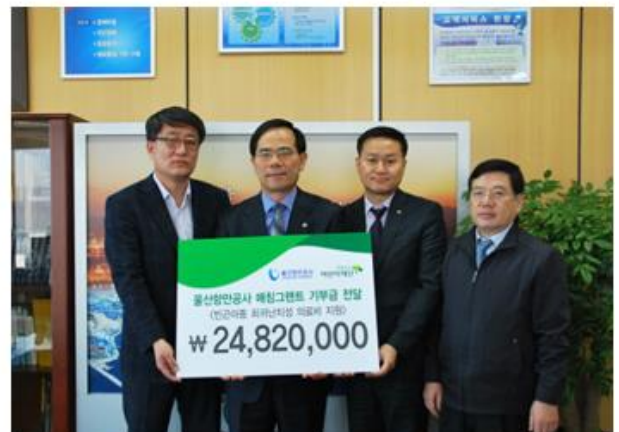
Contribute to matching grant of staff for treatment of intractable diseases (Dec. 24, 2013)